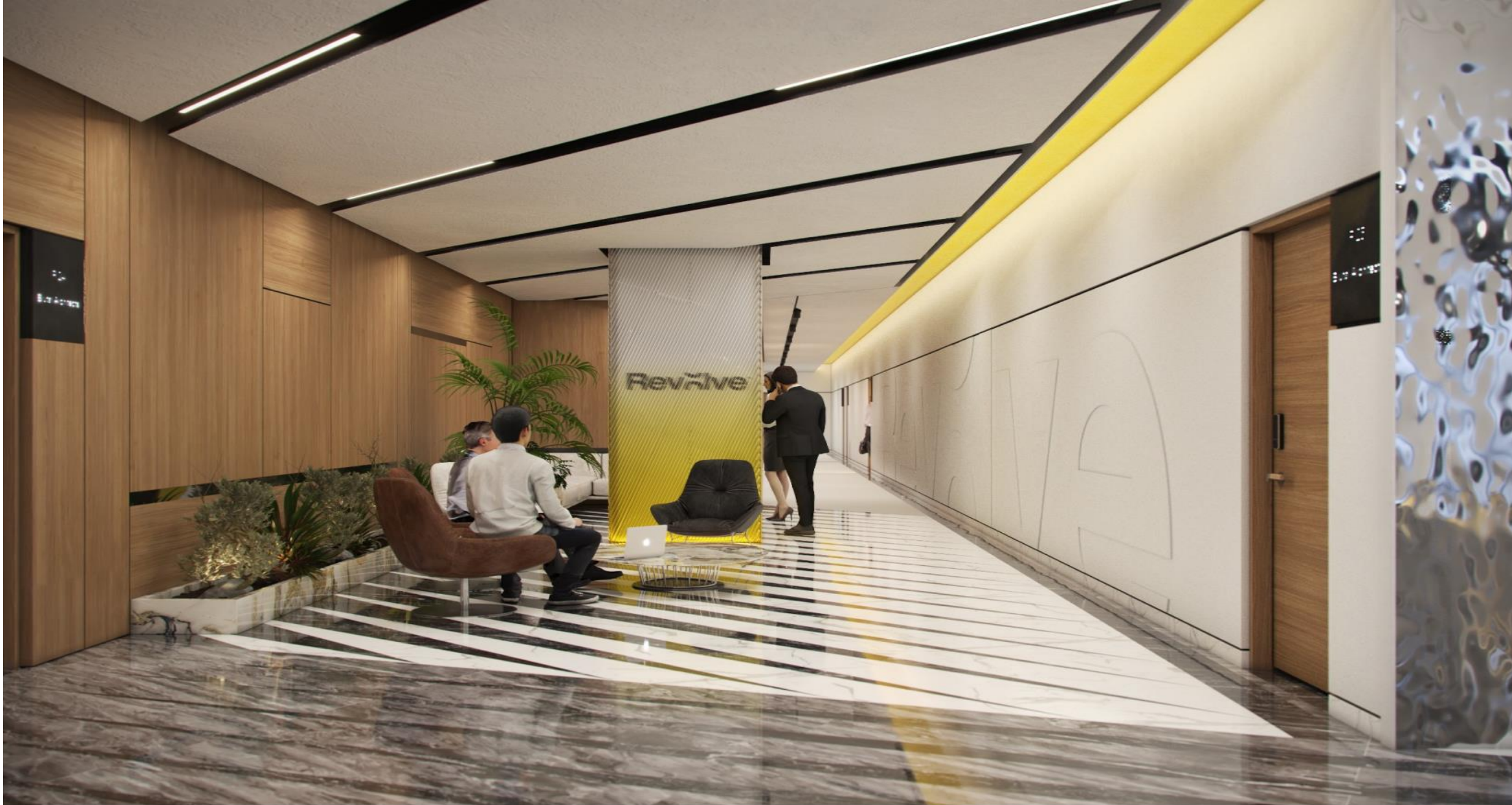
OFFICES WAITING AREA